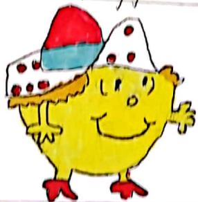
Little Miss Splendid