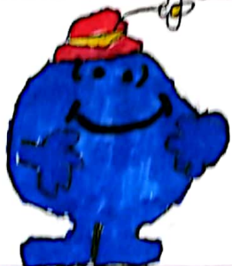
Little Miss Bossy