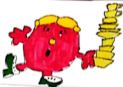
Little Miss Helpful