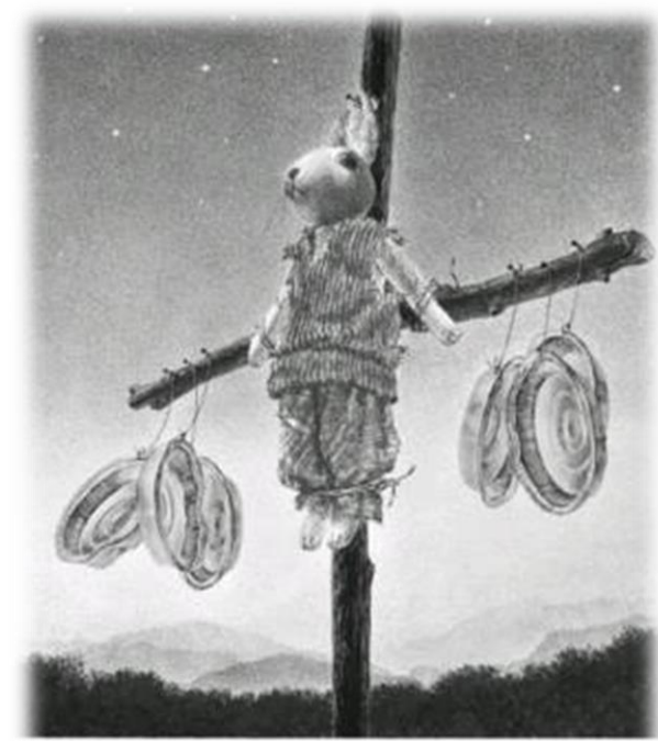
I HAVE BEEN LOVED, EDWARD TOLD THE STARS.

👍 Goodbyes should be done in advance, because there is often no time to say goodbyes. We should cherish every meeting and every goodbye.