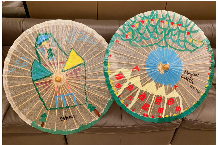
Oiled paper umbrella