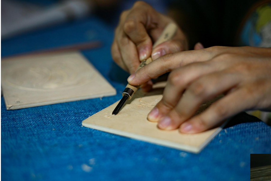
Huizhou Woodblock Painting