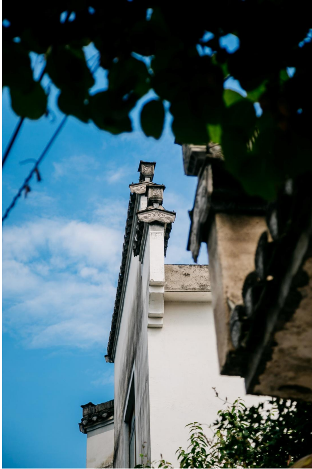
Ma Tau Wall