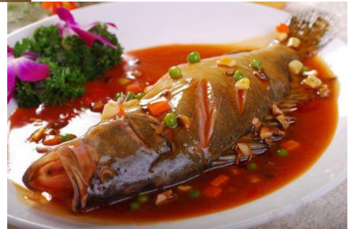
Smelly mandarin fish